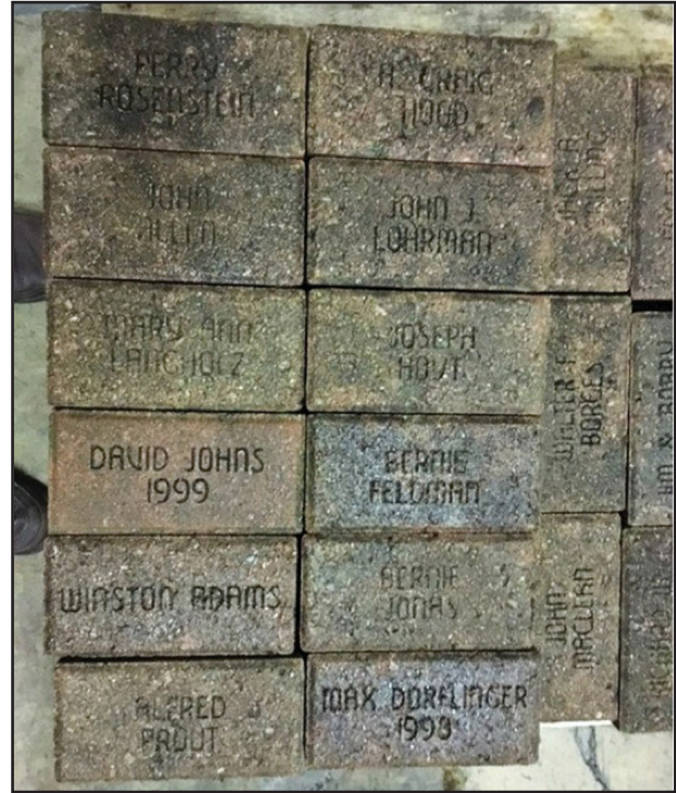
HALL OF FAME PAVERS CLEANED AND IN STORAGE

REPRINTED FROM DISTRIBUTOR'S LINK MAGAZINE | SPRING 2016