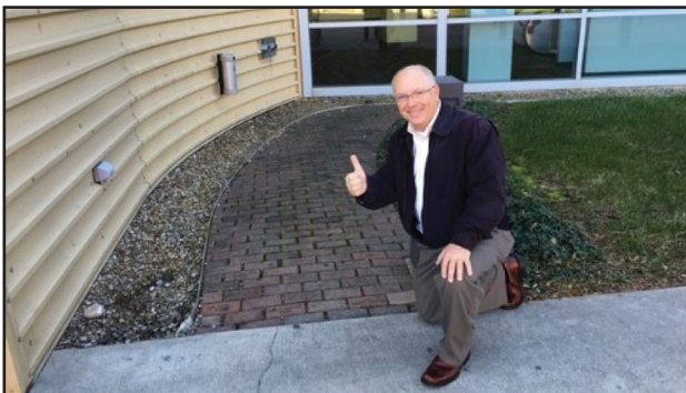
FASTENER HALL OF FAME WALKWAY PRIOR TO REMOVAL